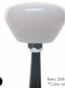
Retro Shift Knob *Color will be sent at random