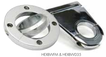
HEXBWFM & HEXBWD35